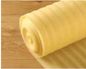
ELKA LAY 609920