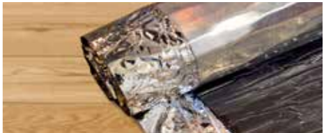
3MM UNDERLAY WITH SOUND PROOFING / SELF ADHESIVE

Handy lightweight 10m 2 roll Luxury 3mm underlay for use with solid floors up to 150mm and real wood engineered floors up to 190mm Specialist installation over hard surface substrates Noise reducing, shock absorbent – impressive 22db sound reduction Foil backing with 50mm tape overlap Self adhesive – bonds floor directly to underlay