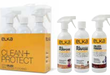
CLEAN & PROTECT FOR OILED WOOD FLOORING 613359