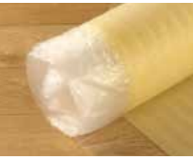
ELKA DUO LAY 609919