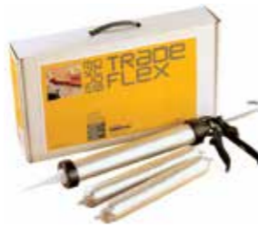
ELKA BOND TRADE FLEX 609970