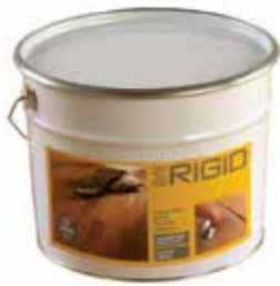
ELKA BOND RIGID 609965