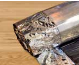
ELKA 3 IN 1 LAY 610515