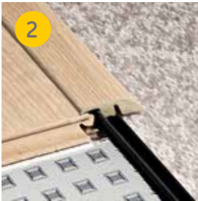
Adaptor Profile 1850 x 43.7 x 12.5 mm