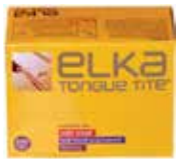
ELKA TONGUE TITE 609969