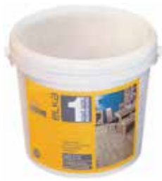
ELKA 1 COAT DPM 609947