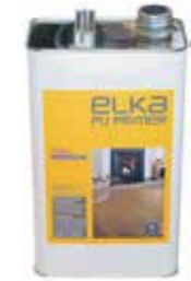
ELKA PRIMER 610513

With Elka accessories, the right solution is always at hand to finish the job. From real wood veneer profiles and scotia to complement real wood flooring, to the easy-to-use 3in1 profiles that allow you to simply trim off the area of the product not required.