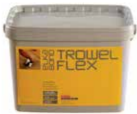
ELKA BOND TROWEL FLEX 609972