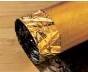
ELKA QT LAY 609964