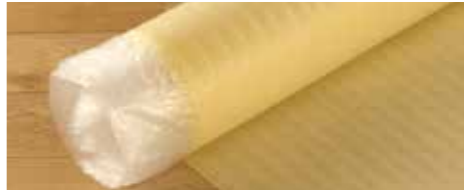
3MM UNDERLAY WITH VPB VAPOUR PROOF BARRIER

Handy lightweight 15m 2 roll Robust 3mm underlay for use with laminate and real wood engineered flooring Includes laminated Vapour Proof Barrier (VPB) back for concrete ground floor installations Suitable for underfloor heating