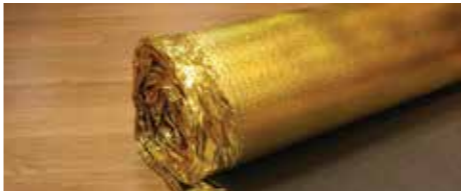
5MM UNDERLAY WITH CUSHIONED SUPPORT / VPB / SOUND PROOFING

Handy lightweight 15m 2 roll Luxury 5mm underlay for use with laminate and real wood engineered flooring 20db sound reduction Low thermal resistance Cushioned support increases underfoot comfort Shock absorbent / vapour barrier Exceptional acoustic insulation performance Suitable for embedded underfloor heating Integrated VPB system