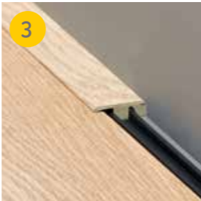
Edge Profile 1850 x 33.4 x 12.5 mm