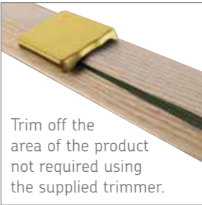
Trim off the area of the product not required using the supplied trimmer.