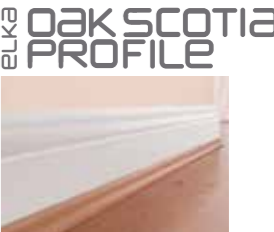
ELKA OAK SCOTIA PROFILE 609966