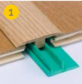
Expansion Profile to cover expansion gaps between two adjacent flooring products of the same height.

Elka 3in1 Real Wood Profile is a flexible finishing profile designed to complete your real wood flooring utilising the latest design technology with a practical multifunctional profile moulding. This easy-to-use profile allows you to simply trim off the area of the product not required to create one of three finishing solutions.