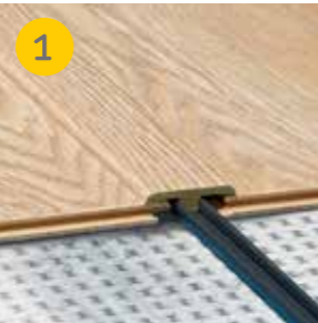
Expansion Profile 1850 x 33.4 x 10.5 mm