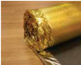
ELKA COMFORT LAY 613127