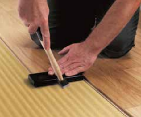
1 tapping block, 1 pull bar and 40 spacers

FOR FITTING LAMINATE AND MOST UNICLIC® FLOORING QUICKLY AND EASILY.