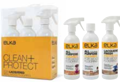
CLEAN & PROTECT FOR LACQUERED WOOD FLOORING 613360