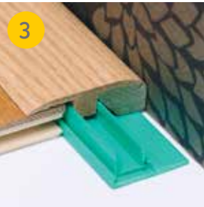
Edge Profile to finish the flooring where a dressed edge is required eg. against a wall or window.