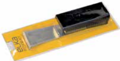
ELKA FITTING KIT 610436