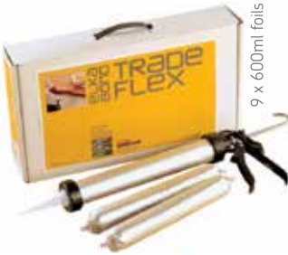
9 x 600ml foils