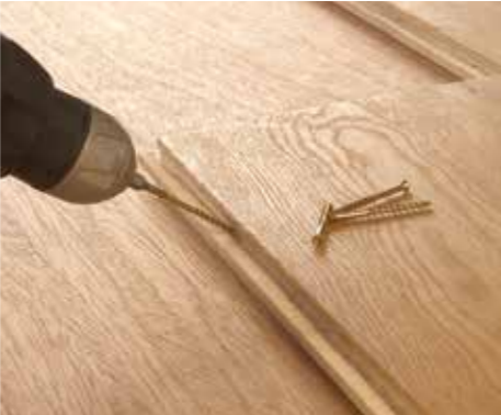
200 no. per box and 1 no. adaptor bit

SUPERB PRODUCT FOR SCREW FIXING SOLID OR REAL WOOD ENGINEERED (18MM+) FLOORING TO ANY WOOD SUBSTRATE