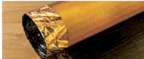
5MM UNDERLAY WITH VPB / SOUND PROOFING

Handy lightweight 15m 2 roll Luxury 5mm underlay for use with laminate and real wood engineered flooring Floor levelling characteristics Exceptional acoustic insulation performance 22db sound reduction Shock absorbent / vapour barrier Integrated VPB system Suitable for embedded underfloor heating Low thermal resistance: 0.70 tog Cushioned support increases underfoot comfort