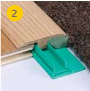
Adaptor Profile for use when finishing between two adjoining floor coverings where the adjacent floor covering is of a lower height e.g. carpets or vinyl.